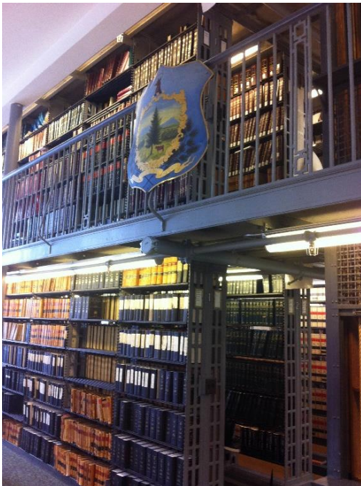
Vermont Department of Libraries – Montpelier, VT

All 50 states have some entity that serves as a “state library agency.” In some instances, these entities are referred to as “state libraries” and operate large facilities, house large collections of books and other resources, have extensive professional staffing, and offer a wide array of services directly to the public. The Library of Virginia with a budget in excess of 35 million dollars is a good example of this model.